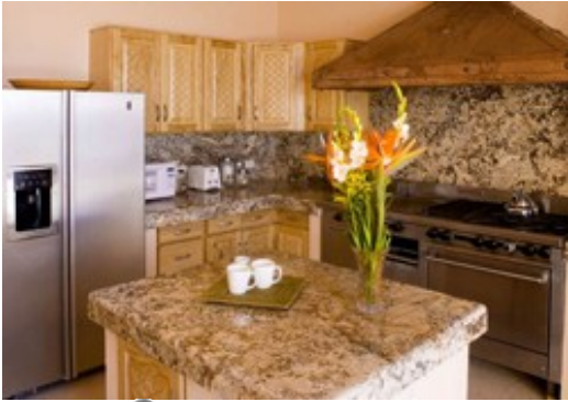
Click Image for Detail