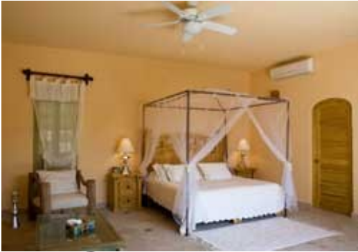
Click Image for Detail