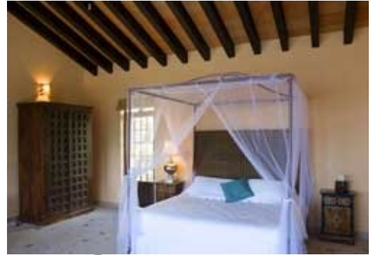
Click Image for Detail