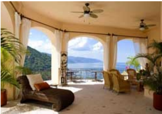
Click Image for Detail