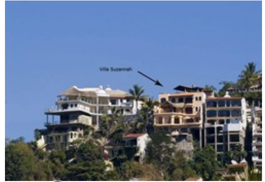
Click Image for Detail