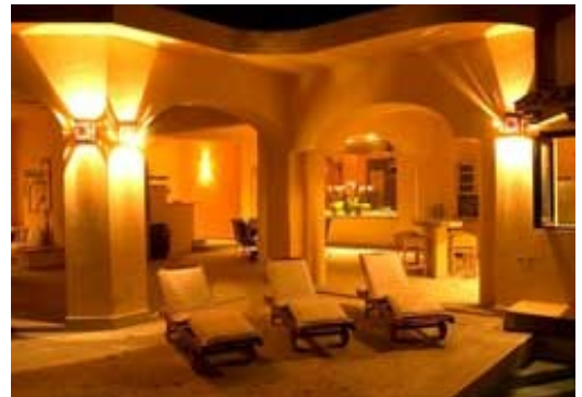
Click Image for Detail