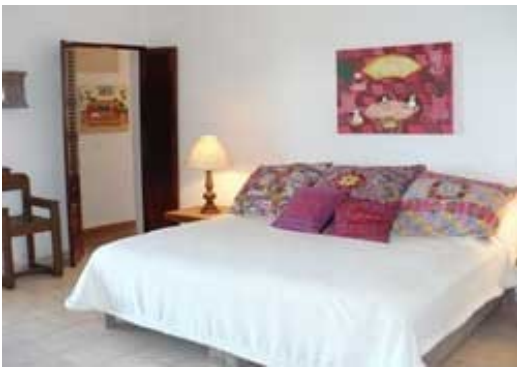
Click Image for Detail

The lower level includes kitchen, living, dining, guest bath and media room. Two full bedrooms, each with attached baths and beautiful decor, are also on this level. The master suite covers the entire upper level and features a private balcony, ensuite bathroom and king bed.