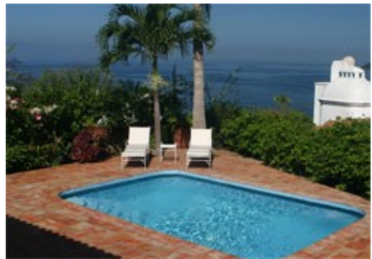
Click Image for Detail