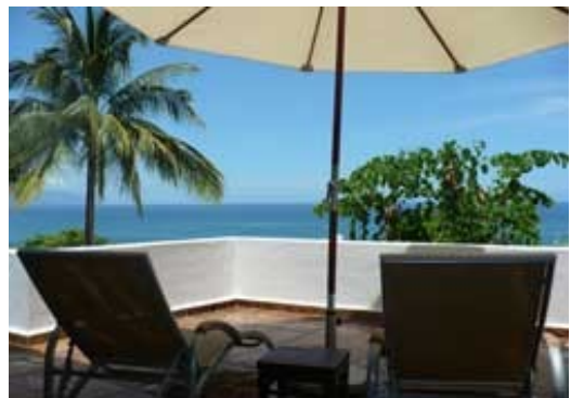
Click Image for Detail