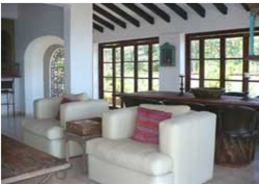
Click Image for Detail