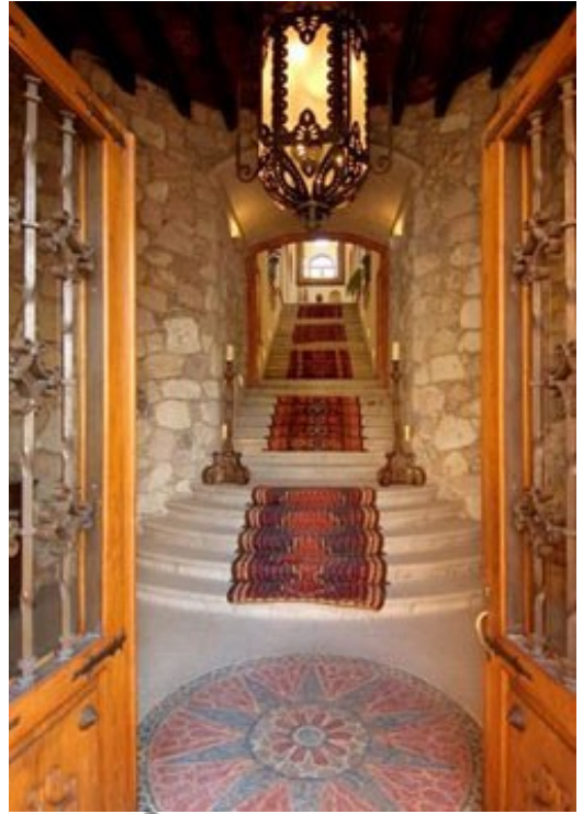
Click Image for Detail