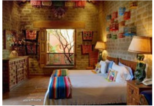
Click Image for Detail