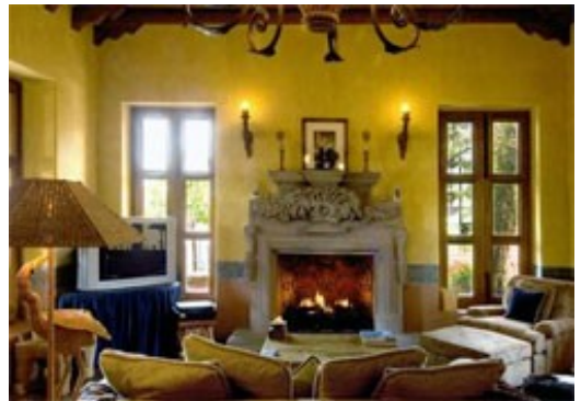
Click Image for Detail