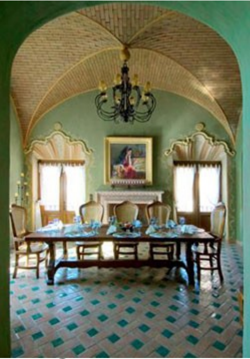
Click Image for Detail