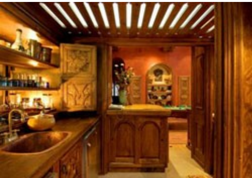
Click Image for Detail