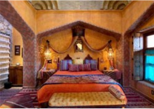
Click Image for Detail